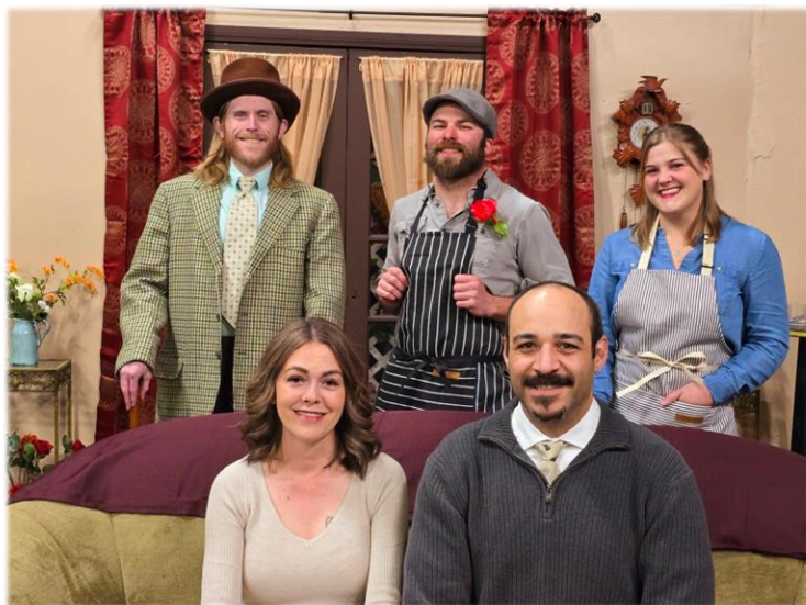
The cast picture as taken in the Verani Apartment.