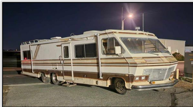
The RV on its way to its new home