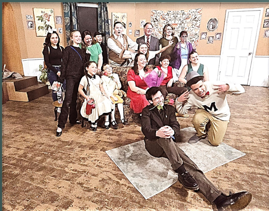
The talented cast of Cheaper By The Dozen .

"There is no waste of any kind in the world that equals the waste from needless, ill-directed and ineffective motions, and their resulting unnecessary fatigue." – Frank Gilbreth