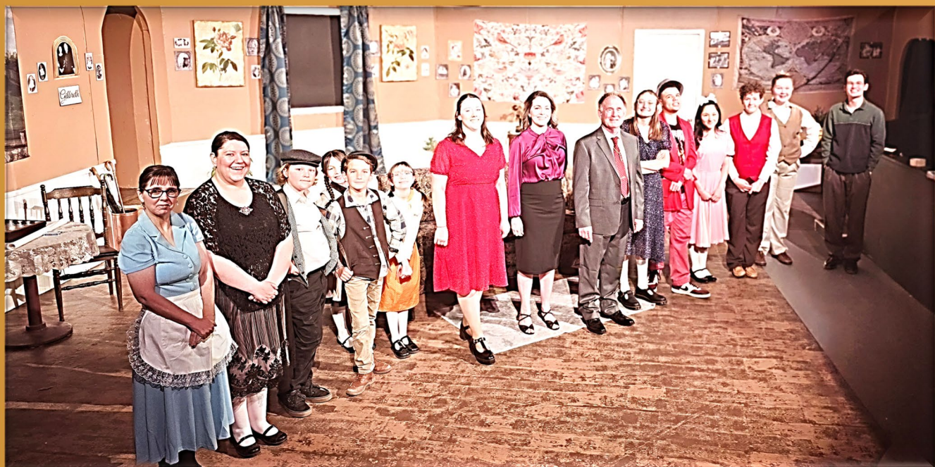
The talented cast of Cheaper By The Dozen .

According to thegilbreths.com , the Montclair house was named "Mostulab." Frank loved to name things with short, catchy nicknames derived from his working terms. When they bought the Montclair house in 1919, he christened it "Mostulab" — short for "Motion Studies Laboratory" — but the clumsy name was rarely used.