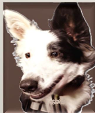
Jazzie as herself

"We're all like tools. Not only like tools, we are tools, tools of Time. We're worn into grooves by Time — by our habits. In the end, these grooves are going to show whether we've been second-rate or champions, each in his way, in dispatching the affairs of every day. By choosing our habits, we determine the grooves into which Time will wear us; and these are grooves that enrich our lives and make for ease of mind, peace, happiness — achievement." — Frank Gilbreth