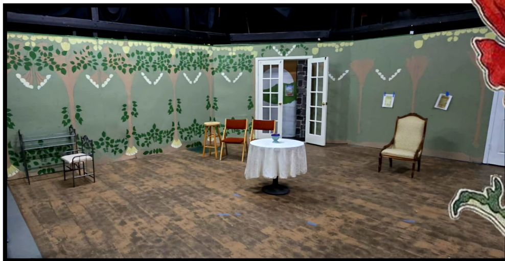
The stage is nearly set for opening night of Dear Brutus .

The only full production I have directed for CLOTA was Taming of the Shrew . I have, however, directed a number Reader's Theater and staged readings, including A Midsummer Night's Dream , and Dear Brutus .